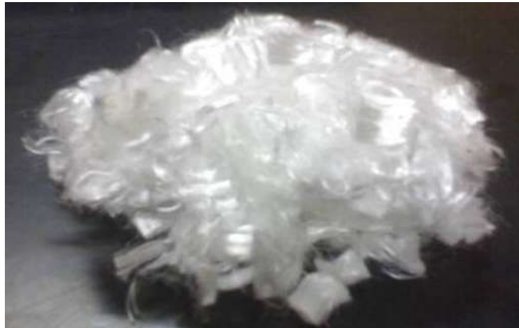
Figure 1. Polypropylene fibres