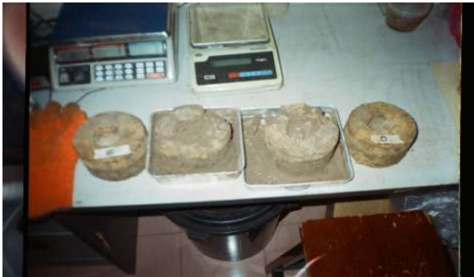
Figure 4. Intactness and uniformity comparison between treated peat CBR samples having fibres with samples without fibres (inside dishes)